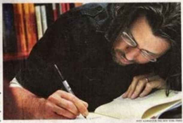
Consider the Author David Foster Wallace in 2006.